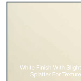
White Finish With Slight Splatter For Texture