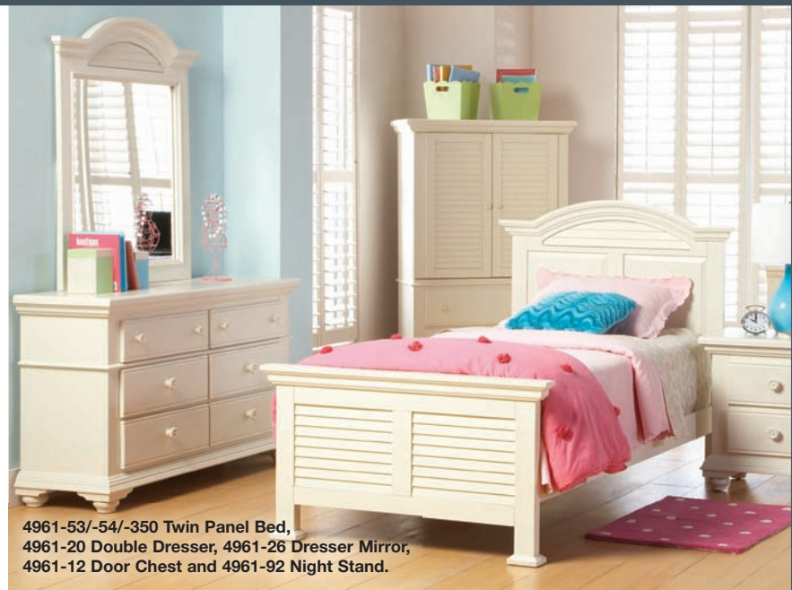
4961-53/-54/-350 Twin Panel Bed, 4961-20 Double Dresser, 4961-26 Dresser Mirror, 4961-12 Door Chest and 4961-92 Night Stand.

All the joy of summer vacations can be found throughout the year in the Pleasant Isle® bedroom by Broyhill. Perfect for a casual and comfortable lifestyle, this collection features a louvered shutter effect on the headboard, footboard and door panels, adding to the feeling of a sea-inspired retreat.